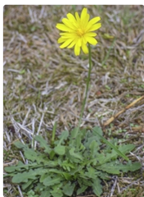
Flowering plant. near Macedon, Vic