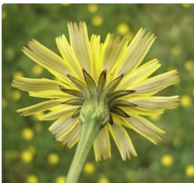
Back of flower head.