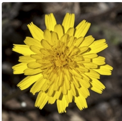
Flower head.