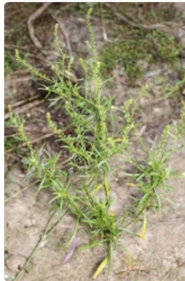
Plant. east of Hay