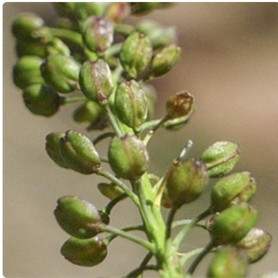
Seed cases. near Melbourne, Vic