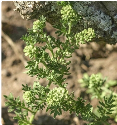
Flowering stems. Photographer Bart Wursten, Zimbabwe