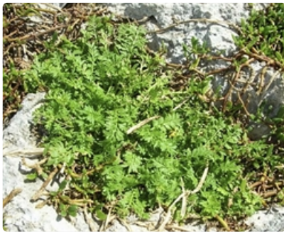
Plant.