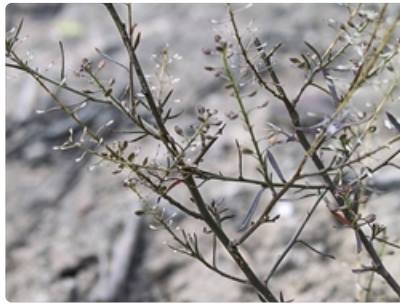
Seeding stems.