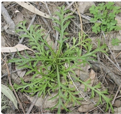
Rosette.