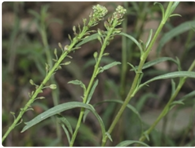
Flowering and seeding stems and leafy stem