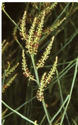
Flowering branches. Photographer Don Wood, Booderee National Park, Jervis Bay