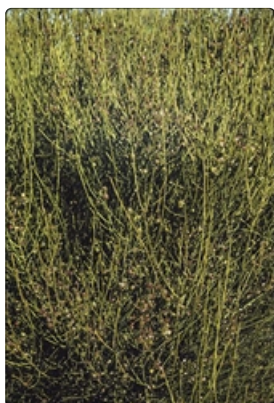
Shrub. unknown place