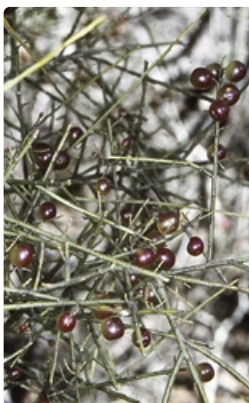
Fruiting branches. Monga State Forest east of Braidwood