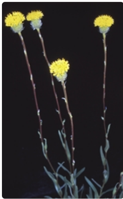
Flowering stems. Photographer Don Wood, Namadji National Park