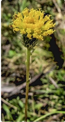
Flower head.