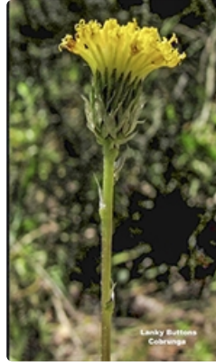
Flower head.