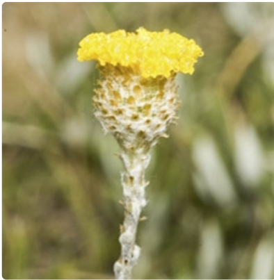
Flower head (subsp. alpinus ). Australian Plant Image Index, photographer Murray Fagg, Mt Kosciuszko