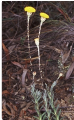
Flowering plants (subsp. squamatus ). Photographer Don Wood, Gungahlin Hill, ACT