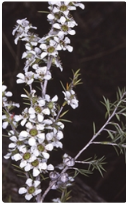
Flowers, seed cases, and leaves. East Boyd State Forest south of Eden