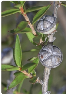
Nuts and leaves. Macedon Ranges, Vic