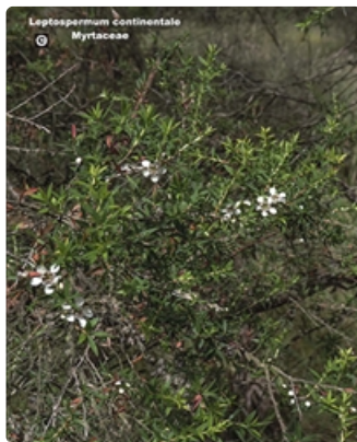
Shrub.