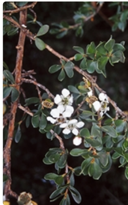
Flowering branches. Photographer Don Wood, Australian National Botanic Gardens, Canberra, ACT