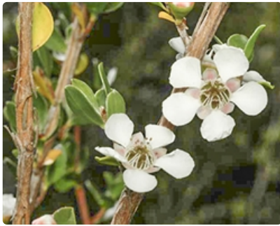
Flowers and leaves. Landers Creek waterfall, Kosciuszko National Park