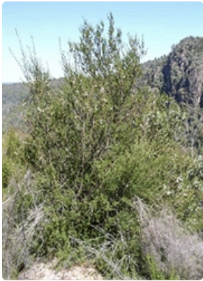
Shrub. Kosciuszko National Park