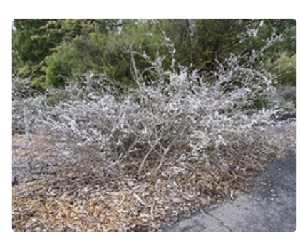
Shrub. Australian Plant Image Index, photographer Murray Fagg, Australian National Botanic Gardens, Canberra, ACT