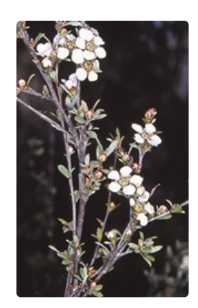
Flow ering branch. Photographer Don Wood, Black Mountain, Canberra, ACT