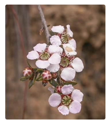
Flow ering branch.