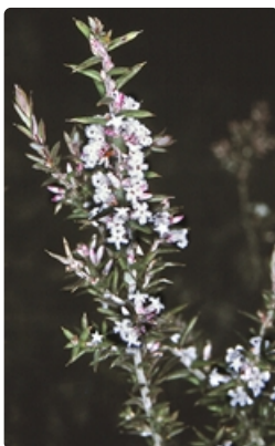
Flowering branch. Nadgee Nature Reserve south of Eden