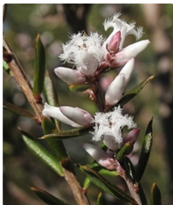
Flowering stem.