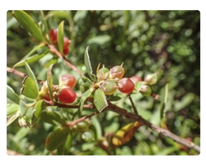
Fruiting branch.