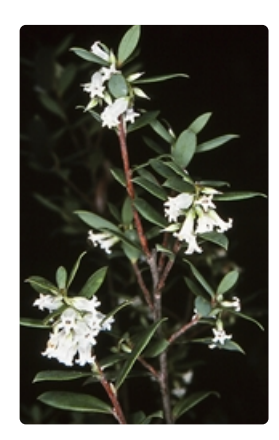
Flow ering branches. Photographer Don Wood, Wadbilliga National Park