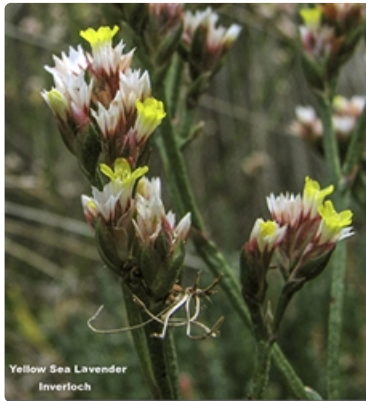
Flowering stems.