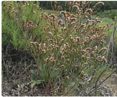
Flowering plant.