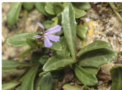
Flower and leaves. Mmrosa Rocks National Park east of Bega