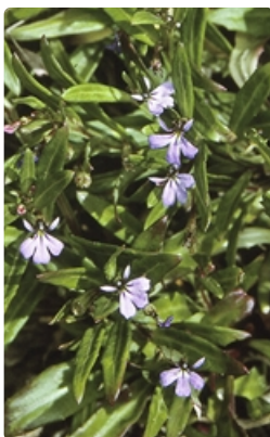
Flowering plants. Eurobodalla National Park south of Narooma