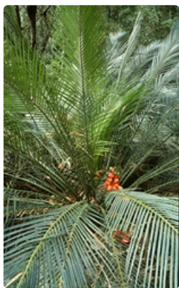
Seeds and leaves. Buckenbowra State Forest west of Batemans Bay