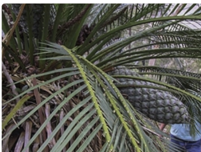
Leaves and young female cone.