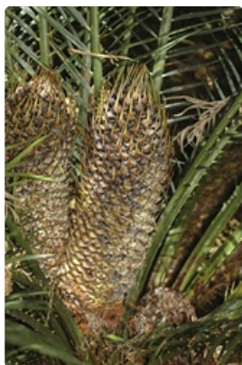
Young male cones.