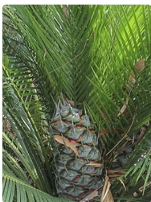
Almost ripe cone about to open.