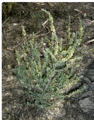
Plant. Murray Sunset National Park, Vic