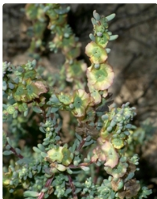
Seed cases. Murray Sunset National Park, Vic