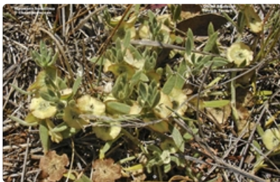
Fruiting plant. Terrick Terrick, Vic