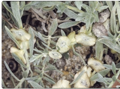
Seed cases and leaves.