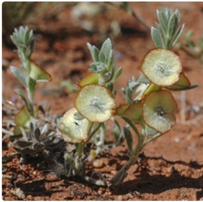
Fruiting plant. Yathong Nature Reserve near Mt Hope, NSW