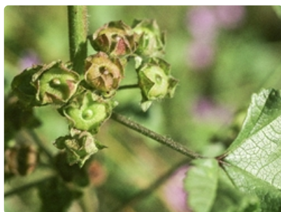
Seed cases and leaf base.