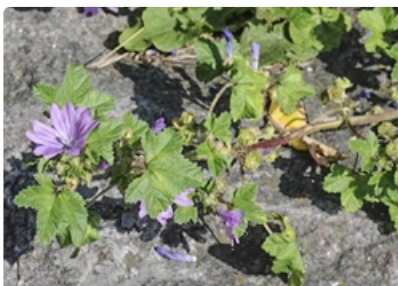
Flowering plant.