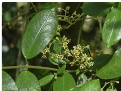
Flowers and leaves.