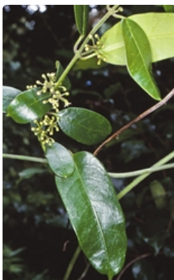
Flowers and leaves. Photographer Don Wood, Budawang National Park west of Batemans Bay