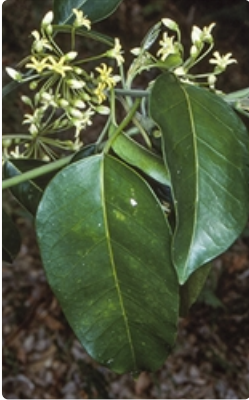
Flowers and leaves. Currowan State Forest, north of Batemans Bay