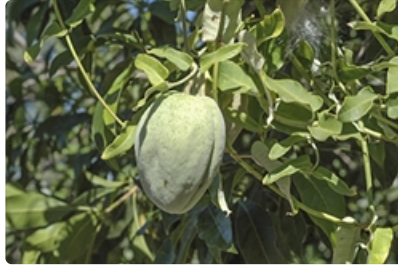
Pod and leaves.