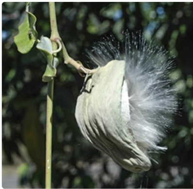
Open pod.