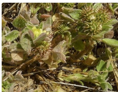
Burrs. Adamina Bay