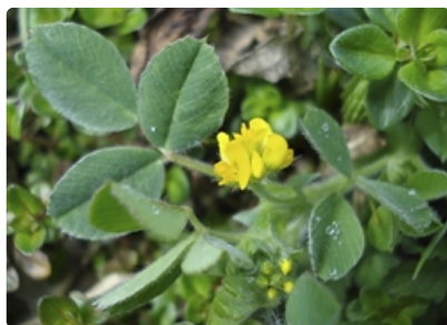
Flowers and leaves.