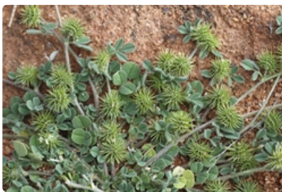
Plant with burrs. Australian Plant Image Index, photographer Murray Fagg, Yalgoo