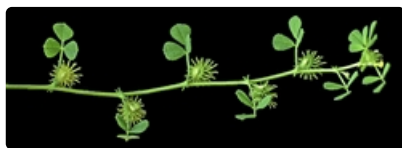
Leaves and burrs on stem. unknown place