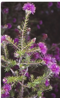
Flowering branches.