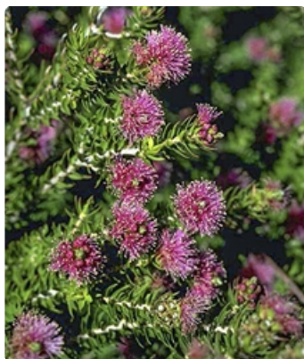
Flowering branches. Royal National Park, Sydney