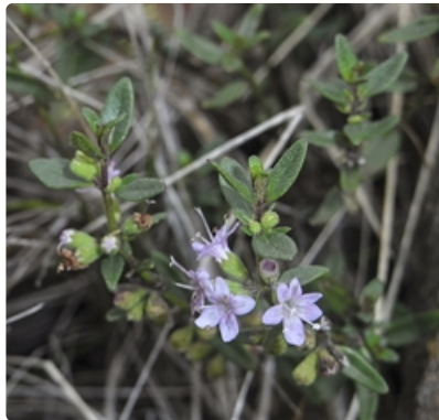
Flowering stems. NW of Melbourne, Vic