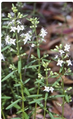
Flowering stems.