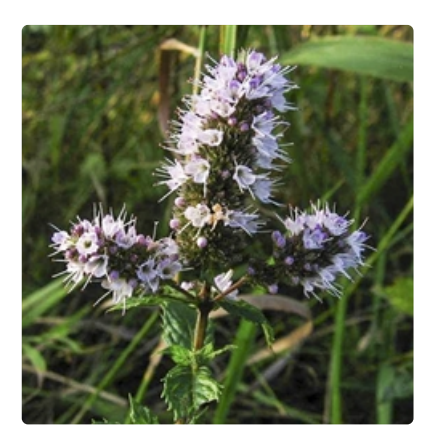
Flower clusters.