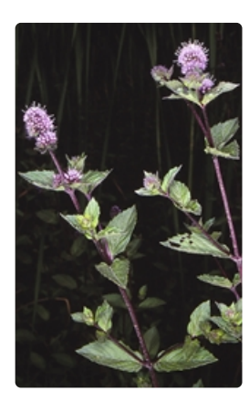
Flowering stems. east of Braidwood