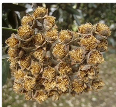
Seed cases full of seeds. Photographer Avenue, New Zealand