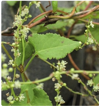
Male flowering stems and leaves.