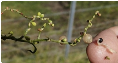
Fruiting stem. Seed on finger.