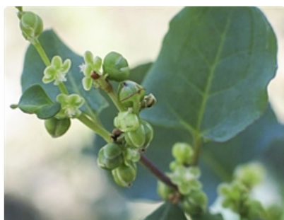
Male flowering stem