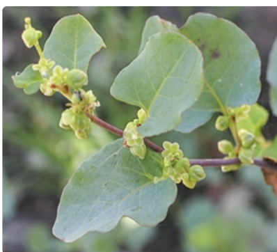
Female flowering stem