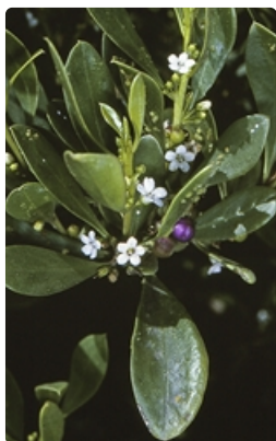
Flowering and fruiting stem. Eurobodalla National Park