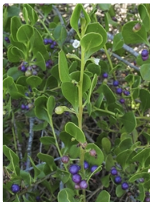
Flowering and fruiting stem.