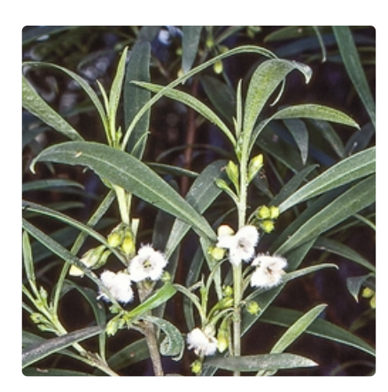
Flowering stems. Bungonia State Conservation Area east of Goulburn