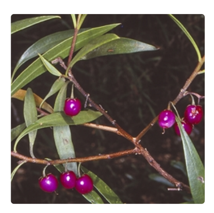
Fruiting stems. Bungonia State Conservation Area east of Goulburn