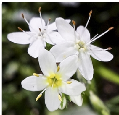
Flowers.