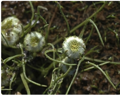
Flowers and leaves. near Barmedan, NE of Temora, NSW