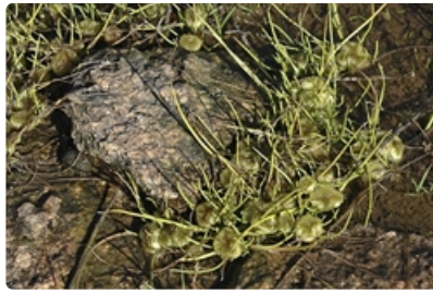
Flowering plants. near Barmedan, NE of Temora, NSW