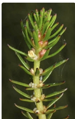
Stem with male flowers above, female flowers below. Kosciuszko National Park