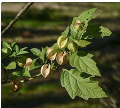
Leafy stem with open seed cases.