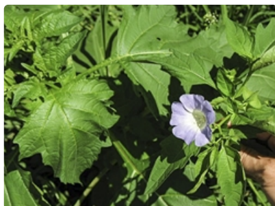
Flower and leaves.