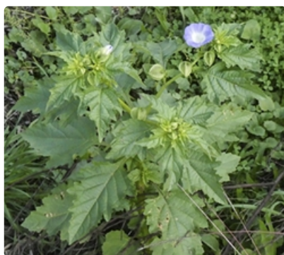
Plant with flowers and young seed cases. Photographer Owen Holton, Canberra, ACT