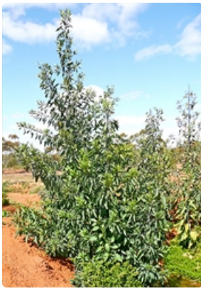
Plant. Scotia Sanctuary, western NSW