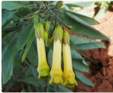
Flowers and leaves. Photographer Don Wood, Scotia Sanctuary, western NSW