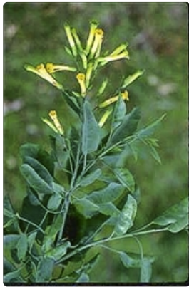
Flowering stem near Midura, NSW