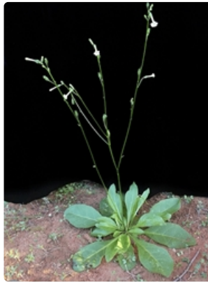
Flowering plant. Scotia Sanctuary, western NSW