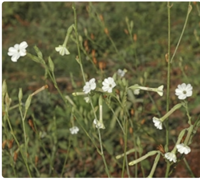
Flowers. Australian Plant Image Index, Photographer Murray Fagg, Yathong Nature Reserve near Mt Hope