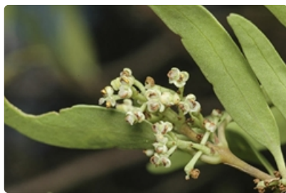
Flowers and leaves.