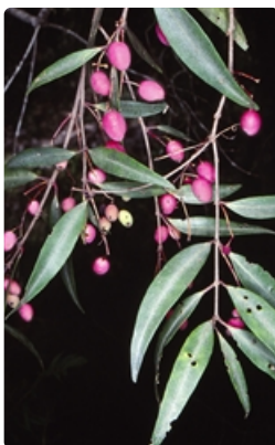
Fruiting stems.