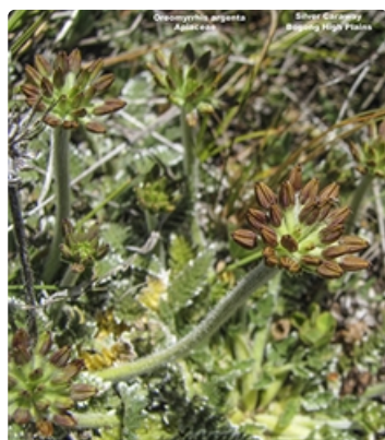
Seeding plants. Bogong High Plains, Vic