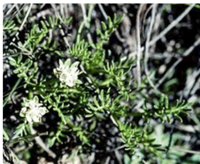
Plants. Australian Plant Image Index, photographer Murray Fagg, unknown place