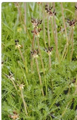
Plants. Australian Plant Image Index, photographer Colin Totterdell, Kosciuszko National Park