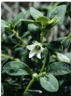
Flower and leaves.