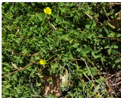
Flowering and fruiting plant. Seed cases circled. Scotia Sanctuary, western NSW