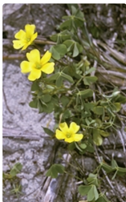
Flowering plant. Photographer Don Wood, Broulee Beach