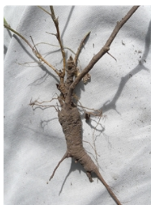
Root.