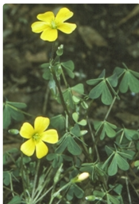
Flowering plant. Berragui Council Reserve south of Berragui