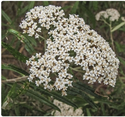
Flower cluster.