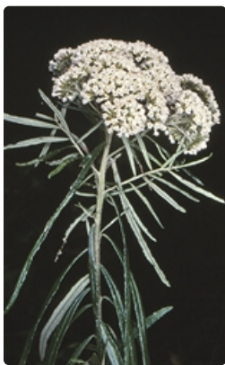
Flowering stem. near Mogo south of Batemans Bay