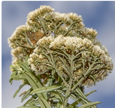
Backs of flower clusters and leaves. Great Otway National Park, Vic