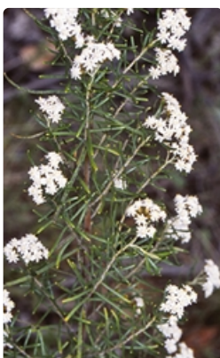
Flowering stems. Photographer Don Wood, Namadgi National Park, ACT