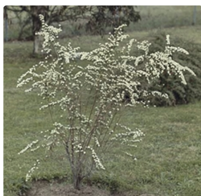
Shrub. Australian Plant Image Index, photographer C Green, Australian National Botanic Gardens, Canberra, ACT