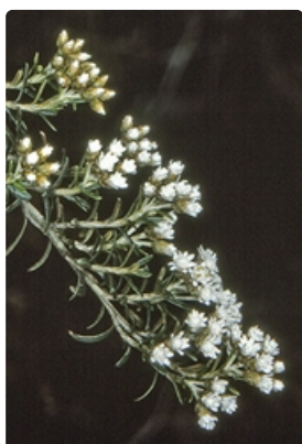
Flowering stems. Bombala State Forest near Bombala