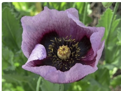
Flower (subsp. setigerum ).