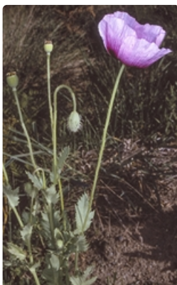
Flowering plant. Princes Highway north of Bega