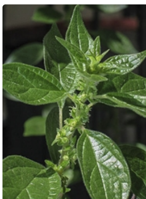
Flowering stem.