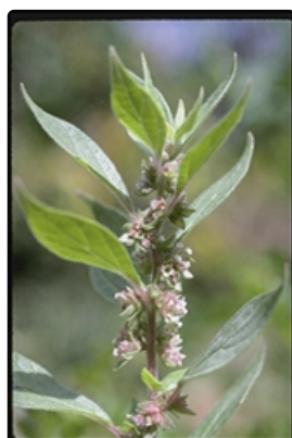
Flowering stem. Australian Plant Image Index, photographer M.Crisp, Gremorne