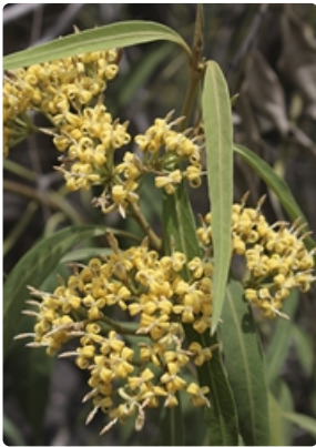
Flowers and leaves.