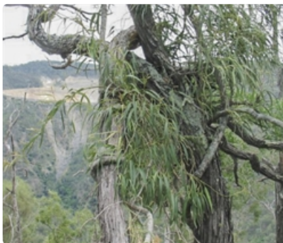
Plant. Bungonia State Conservation Area