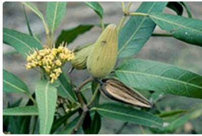
Flowers, pods, and leaves.