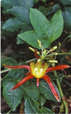
Flower and leaves. feral at Australian National Botanic Gardens, Canberra, ACT