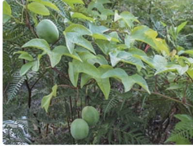
Leafy stems with fruit.