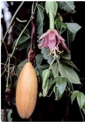
Spent flower and ripe fruit.