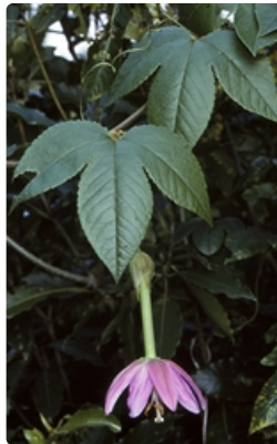
Flower and leaves. near Eden