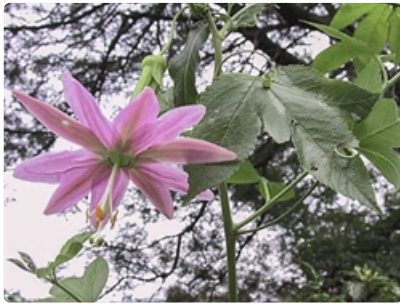
Flower and leaf.