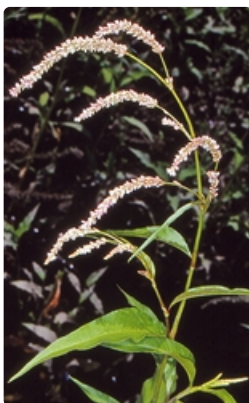
Flowering stem. Namadji National Park, ACT