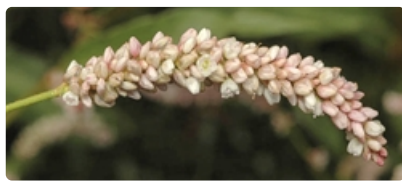
Flower spike. Jerrabomberra Wetlands, ACT